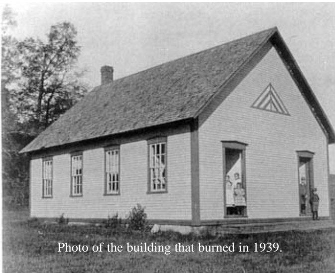
Photo of the building that burned in 1939.

During the early years, when Montpelier included what is now East Montpelier, there were sixteen districts. After the towns separated in 1848, there were eleven town districts plus several partial districts shared with neighboring towns. From the beginning, District #5 was one of the largest. It served families along roads that are now known as Vincent Flats, Putnam Road, Foster Road and Trail Road and parts of Dodge Road, Lyle Young Road, Snow Hill Road, and Kelton Road.