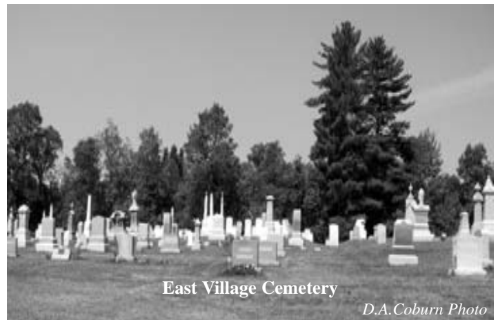
East Village Cemetery

This might be a good opportunity to issue a firm reminder to people to make sure that all animals and pets are properly vaccinated. If anyone does see an animal behaving strangely, please report it immediately.