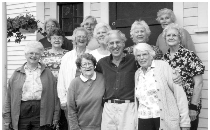
Strong Living class - spring 2005