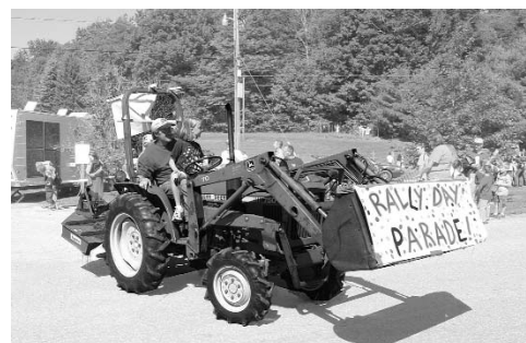
All Rally Day photos by Rick Mastelli