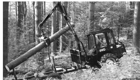
Sustainable Forestry Demonstration

If you can blow bubbles, pitch a tent, or brew tea, please volunteer for an hour on Rally Day.