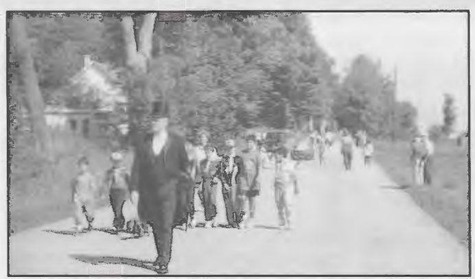
Joe Brown grand marshalls the Bicentennial Rally Day Parade

"The East Montpelier selectmen would like to express our appreciation to the many volunteers who helped make the Town's Bicentennial Rally Weekend, Sept. 7 and 8, a tremendous success.