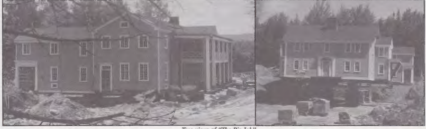
Two views of "The Big Job"

How much business is out there? In good times Norman will move sixty houses a year, bidding on as many as two hundred jobs. The current recession has brought a slow-down in jobs with the result that not much capital is