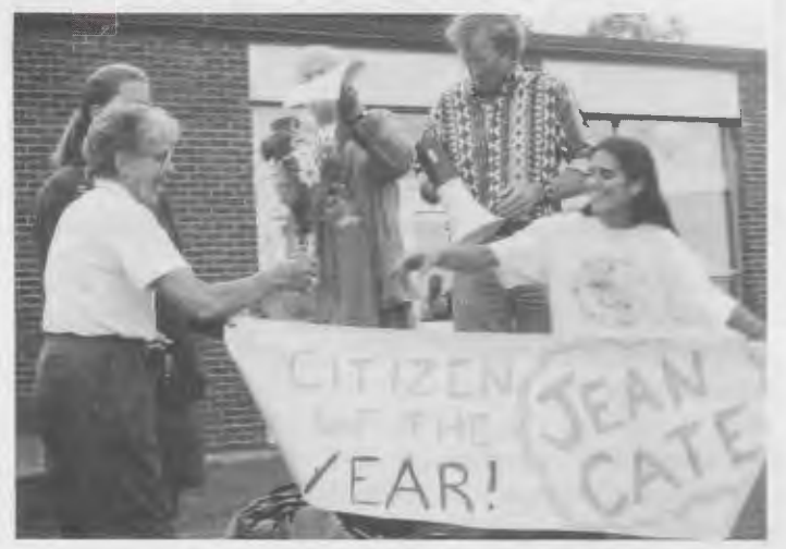
CITIZEN OF THE YEAR!

Some number of years ago, 12 or 13, a group of East Montpelier residents got together to discuss which activities would enhance their community. Both Rally Day and the Signpost were brought to life! Judging by the number of people who attended this year's Rally Day on September 12th and the success of the Signpost Silent Action, that group of residents