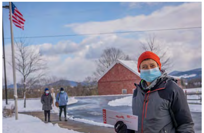
A little snow and cold didn't keep EM voters from the polls.

Licenses are $9 for spayed/neutered dogs and $13 for unaltered dogs. Licensing can be performed curbside at the Town Office or by mail or drop-off with payment and copy of current rabies vaccination. Please call 223-3313 X 201 or X 202 with any questions about licensing your dog.