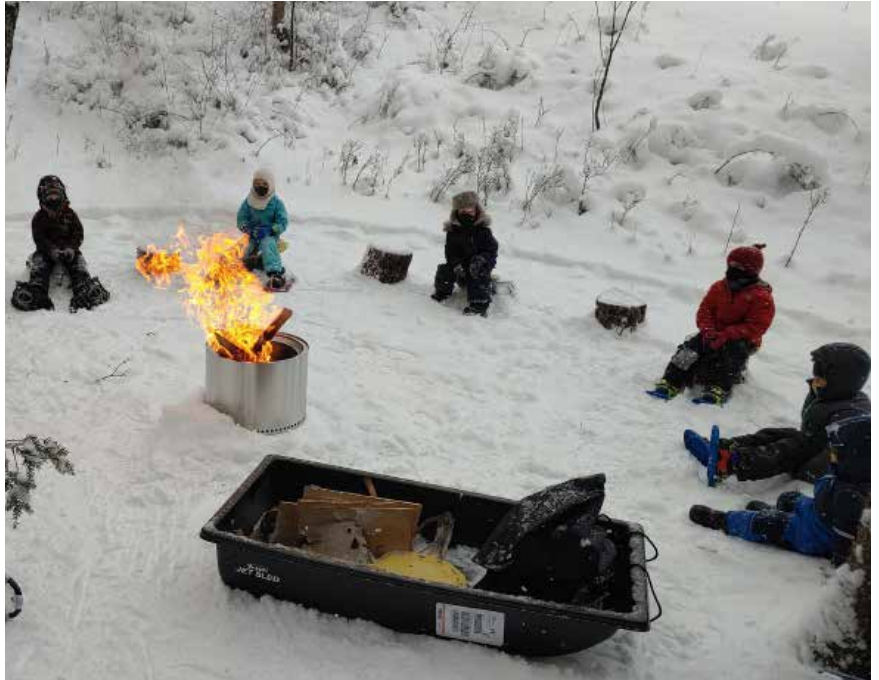
OVWS students in an outdoor classroom

Along the way students write about each activity and make detailed drawings in their treasured Main Lesson books. These Main Lesson books accompany each student through the entire Waldorf experience. I've known adults, Waldorf graduates, who enthusiastically describe their experiences while sharing pages of their decades-old Main