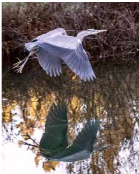
Really Great Blue Heron