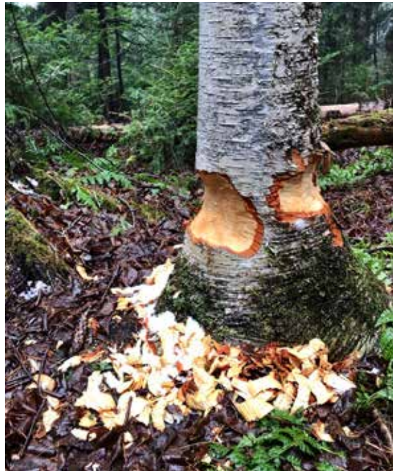
Signs of wildlife spotted on the Town Forest Trail.

On the brighter side, we had a wonderful turnout of volunteers on the three major work days scheduled this year. Many new faces joined those who regularly help out every year. Together, we rerouted the Lollipop Loop of the Mallory Brook Trail, south of Minister Road. The field presented problems with exposure to deer ticks so we rerouted the trail from the open field to higher ground under a sweet mixed pine forest. This loop trail will connect to the new Bobolink Trail, slated for construction in 2022 (with a grant pending at the time of this writing). The new trail section will lead to Schoolhouse Road and then to the Clark Trail, U-32 trails, and down to the new bridge across the Winooski River. Congratulations to the Cross Vermont Trail