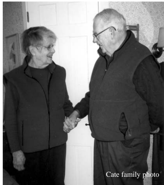
Cate family photo