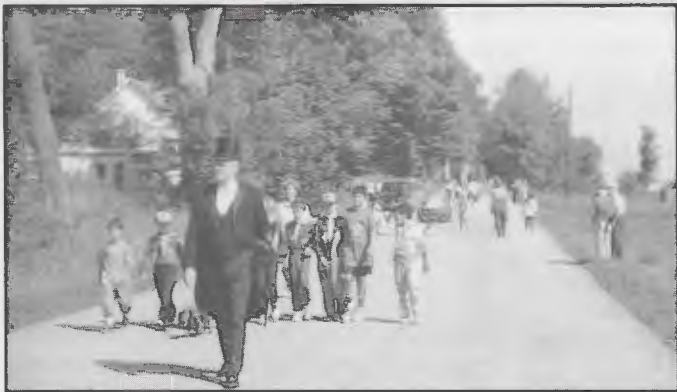
Joe Brown grand marshalls the Bicentennial Rally Day Parade

"The East Montpelier selectmen would like to express our appreciation to the many volunteers who helped make the Town's Bicentennial Rally Weekend, Sept. 7 and 8, a tremendous success.