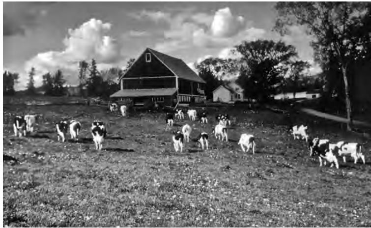
John and Donna Hall's Farm, Circa 1965

Although there are presently only three farms in town shipping milk, we know that in the future our conserved lands will be agriculturally active. Of course, no one knows what type of farming will continue in town. We expect East Montpelier's rich soils will see a variety of uses. Of course, my family and I hope it will include growing crops for dairy farming.