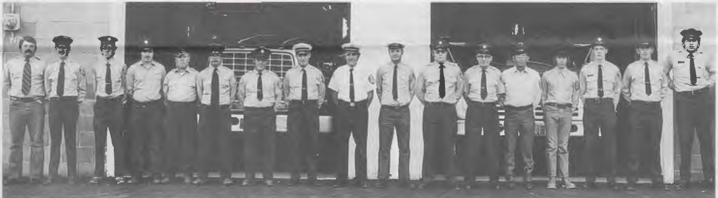
Early photo of EMFD

Years ago, we responded to a Mutual Aid fire at the Capitol Apartments in Montpelier. This building had a very long corridor, and the far end apartment was burning. With no SCBAs, our general rule was to crawl on the floor beneath the smoke and use the hose lines for escape. Unfortunately this time a fireman from another department put water through a hole in the roof into the fire, forcing fire and smoke onto our men. Suddenly our world was black with choking smoke. Rule One — drop down, follow the hose line, and please, oh please, don't let go. Slowly, oh so slowly we made it to the outside fresh air. In this instance, the men had gotten so much smoke that they became physically sick. This is what fighting a fire is like.