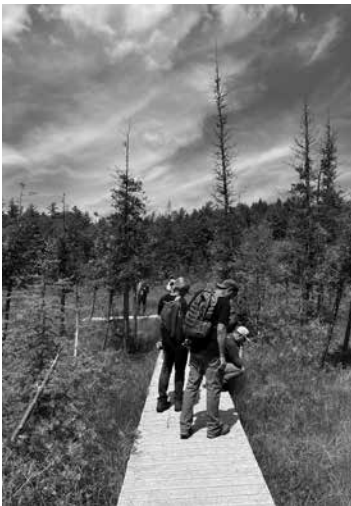
exploring Chickering Bog

The bog was my mother's favorite place in the world. After her stroke, when she was in her 80s, our teenage sons, my husband, my father, and I brought her out to the boardwalk in her wheelchair for one last look. Though challenging, it was a poignant moment for us all.